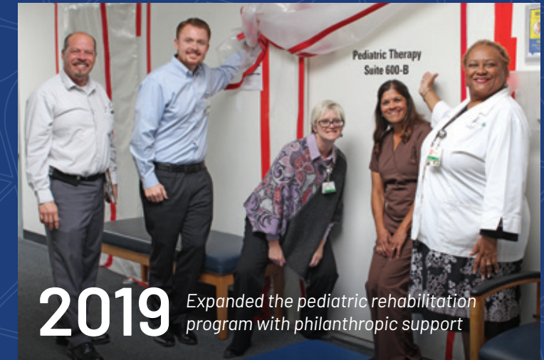
2019 Expanded the pediatric rehabilitation program with philanthropic support