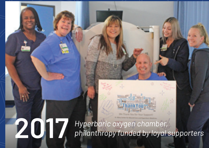
2017 Hyperbaric oxygen chamber, philanthropy funded by loyal supporters