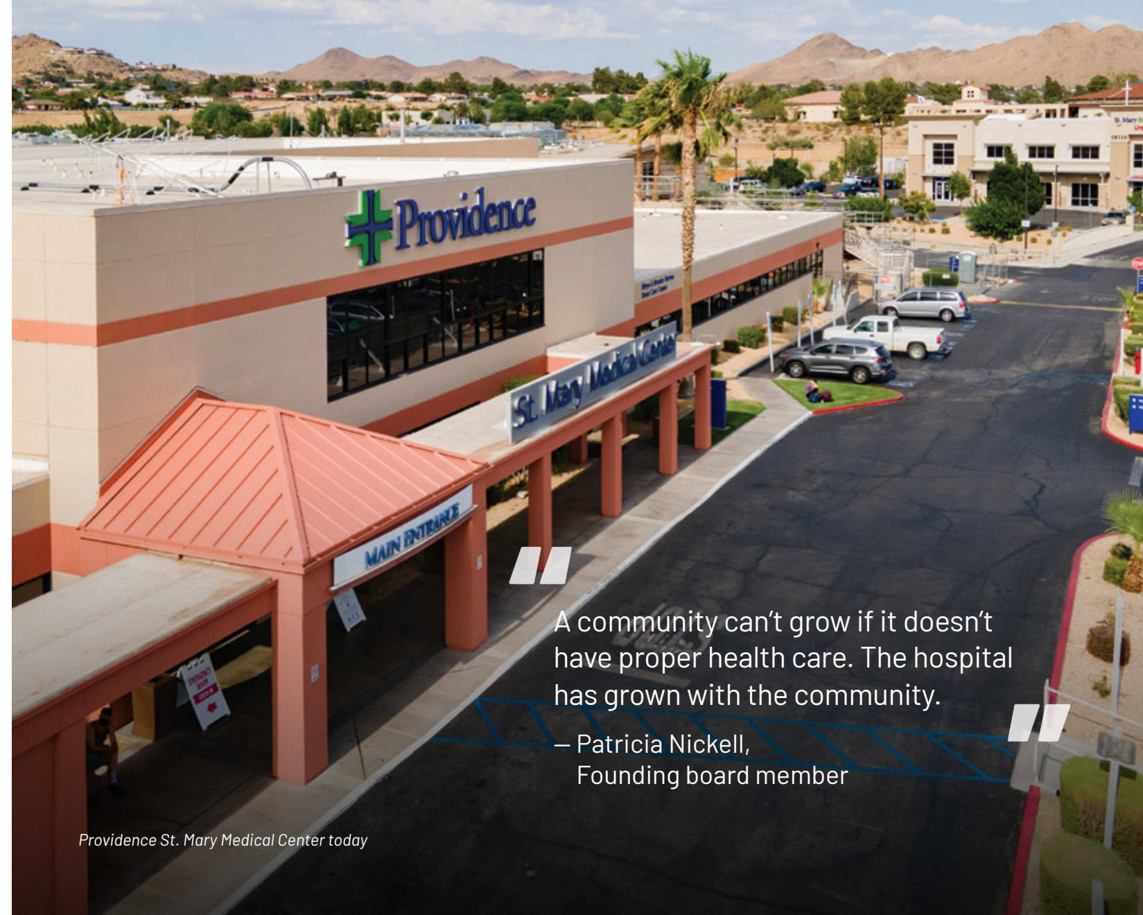
Providence St. Mary Medical Center today