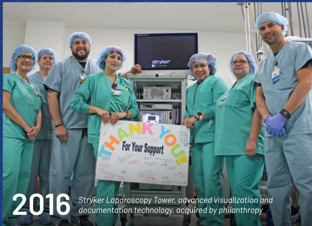
2016 Stryker Laparoscopy Tower, advanced visualization and documentation technology, acquired by philanthropy