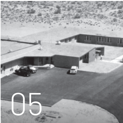
FOUNDATION HISTORY Three Decades of Transforming Lives