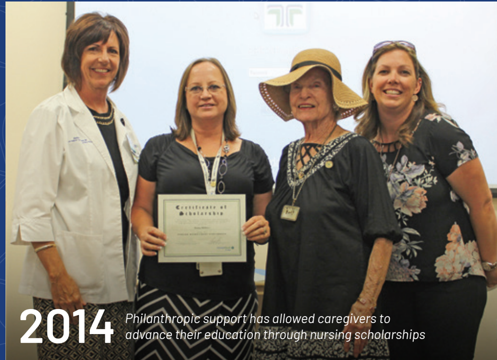
2014 Philanthropic support has allowed caregivers to advance their education through nursing scholarships