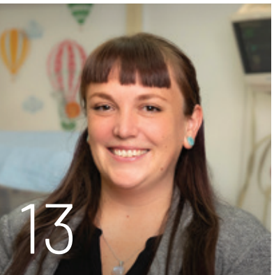
FUNDRAISING UPDATE Bridge Builders Program Receives Major New Grant