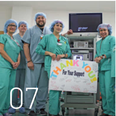
FOUNDATION HISTORY Philanthropic Highlights