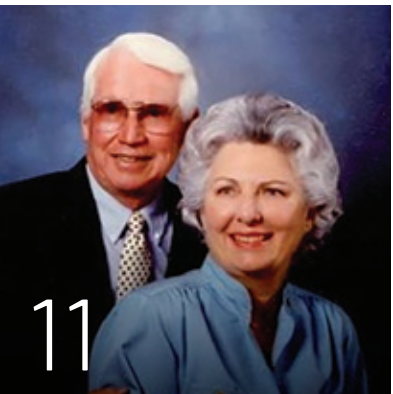
PLANNED GIVING An Impact for the Future Gifts of Real Estate