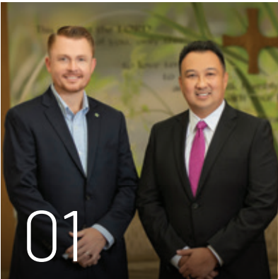
COVER STORY Transforming Our Community – Together