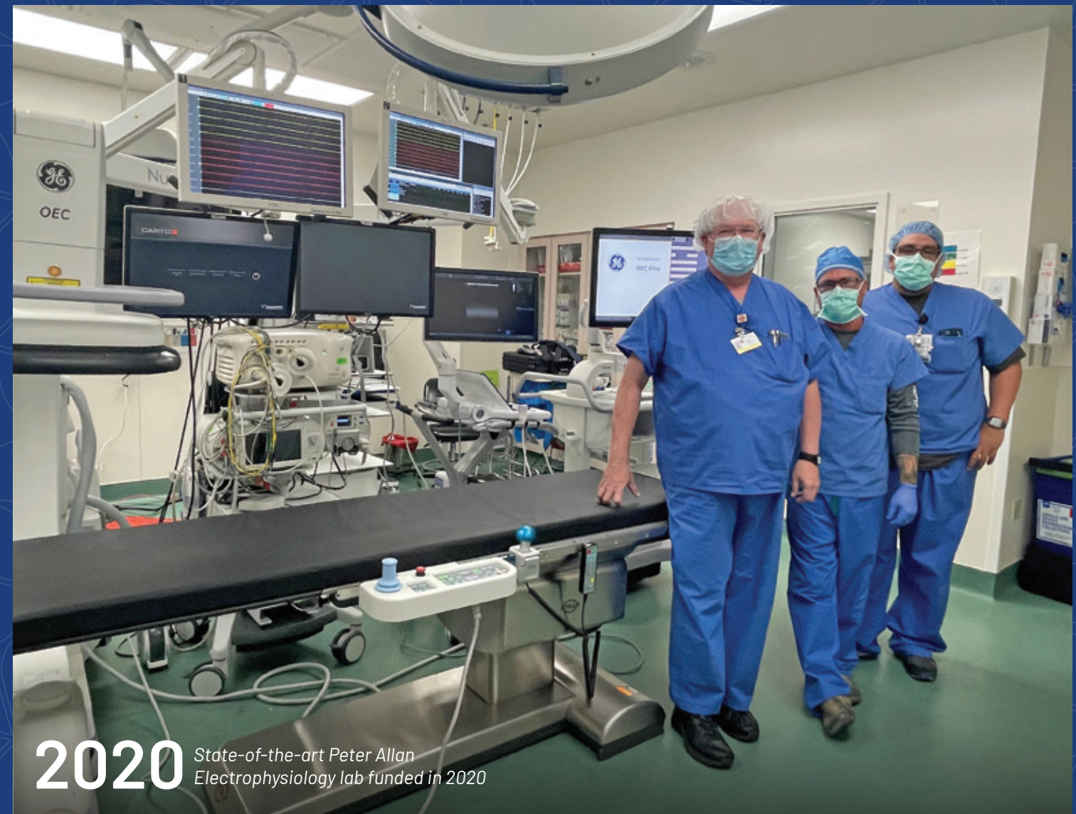
2020 State-of-the-art Peter Allan Electrophysiology lab funded in 2020